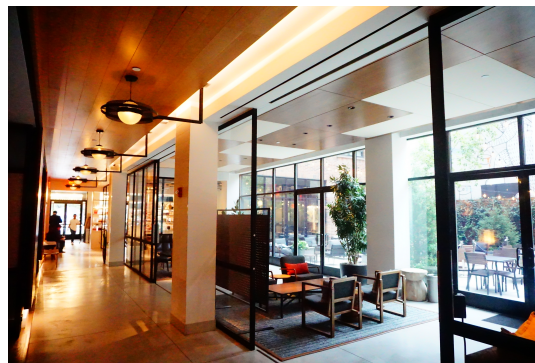
Lobby of my hotel

From Wednesday through Friday of last week, I was in New York City for my first ever work travel opportunity. It was (of course) an exciting adventure, and I got the chance to see a side of New York City I found less intimidating and more endearing. The hotel I got to stay in was so quirky and millennial in SoHo, Manhattan.